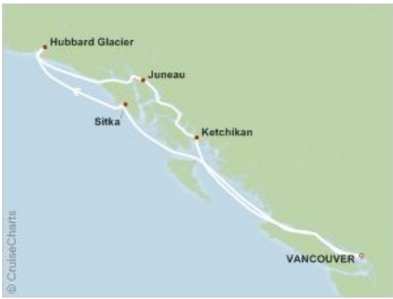
Not a cruise itinerary map, for regional reference only.